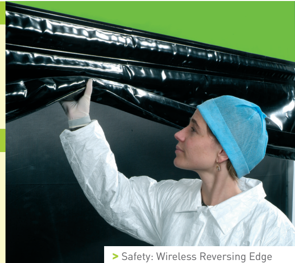
> Safety: Wireless Reversing Edge

The motor is protected by an adapted multi composite cover and has only 5 moving parts (motor, gearbox, limit switch, rolling shaft, bearings) which limits the need for maintenance and grease.