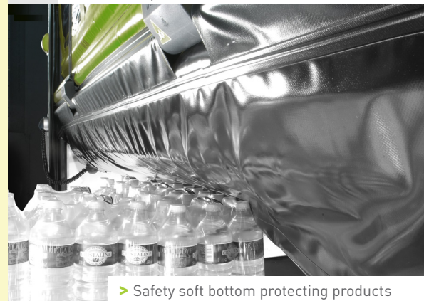
> Safety soft bottom protecting products