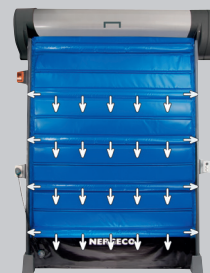
> Seals and handles pressure differences

The Nergeco drive, mounted on the side and protected under a cover, is direct with only 5 moving parts: motor, gearbox, limit switch, rolling shaft for the straps and bearings, which reduces maintenance costs.