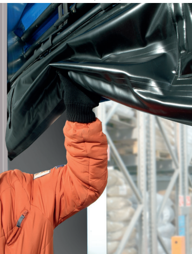
> Safety intelligent curtain