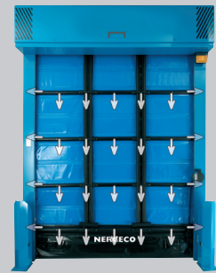
> Seals and handles pressure differences

The C FREEZER 2 has a flexible triple layer curtain with integrated air mattress to reduce conductive temperature loss through the curtain. The sides of the curtain have additional sealing for an enhanced peripheral closing in the vertical side guides. Thanks to this design, no additional sliding door is required for overnight closing.