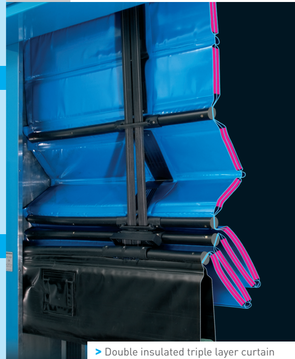
> Double insulated triple layer curtain