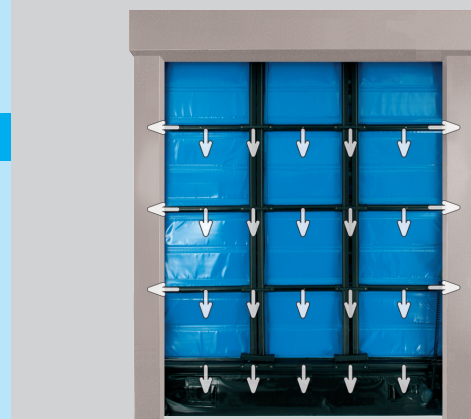
> Seal and handle pressure differences

Thanks to the intelligent curtain the door can open at the last moment and close directly. While the safety of products and goods are guaranteed it minimizes the exposure time of the door. This shortened cycle reduces temperature loss and energy consumption up to 32%.