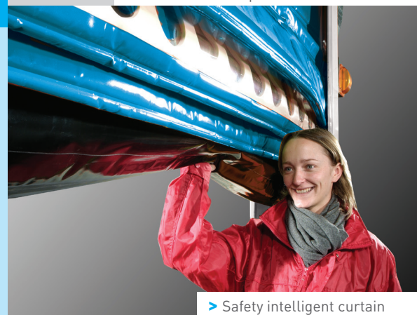
> Safety intelligent curtain

The wide side guides help for a higher productivity. Even if the door is impacted and a stiffener would bend, the folding door will continue to work without interrupting the production flow.